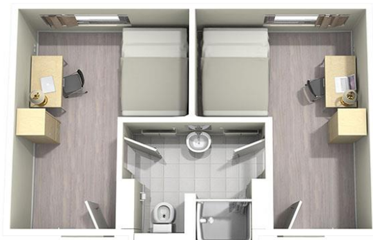
Henderson Residence Suite

Traditional Residence: In the traditional residences, our single and double rooms are furnished with one or two single beds, a desk and chair, and an armoire for each guest. These residences have separate men's and women's washrooms on each floor and are not air-conditioned.