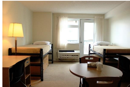
Friel Double Suite Style Room

Suite-style: Air-conditioned suite-style units include a bedroom with two single beds, a washroom with shower, kitchenette equipped with a mini-fridge and microwave, table and chairs. Please note kitchenware such as utensils and dishes are not provided.