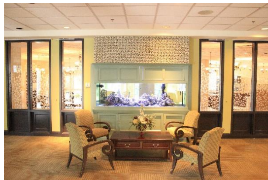
Friel Residence Lobby

Approximately a 10 minute walk to the main campus, this residence is adjacent to a public library, cinema, grocery store (24/7), the By Ward Market, a pharmacy, the uO Health Clinic and in close proximity to bus routes.