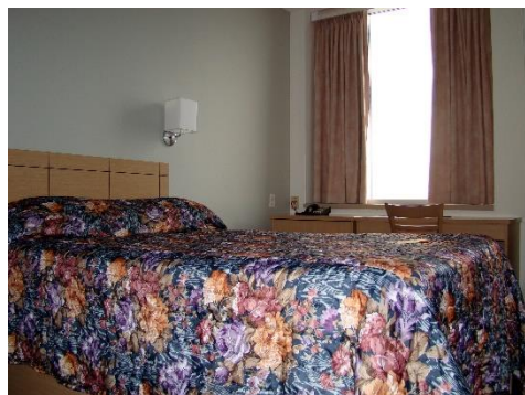
90U Suite Style Guestroom

Suite-style: Air-conditioned suite-style units include two separate bedrooms with a double bed in each room, a washroom with shower, kitchenette equipped with fridge and microwave, table and chairs. Please note kitchenware such as utensils and dishes are not provided.