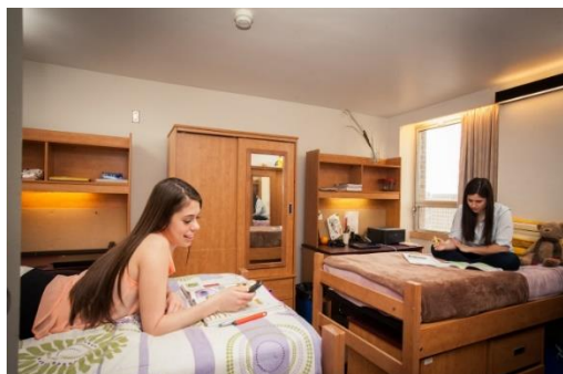
Marchand Residence Double Room

Traditional Residence: In the traditional residences, our single and double rooms are furnished with one or two single beds, a desk and chair, and an armoire for each guest. These residences have separate men's and women's washrooms on each floor and are not air-conditioned.