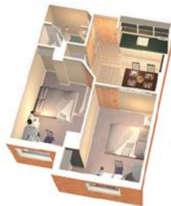
90U Suite Style Guestroom